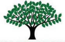
GOD'S GIFT OF LONG LIFE

❖ January Social and Fellowship - Monday, January 22 nd after the 12:05 pm Mass. Since the previous socials have been very successful we have been asked to continue these gatherings monthly. This one in January includes a special treat. Three gracious women of our parish community who have returned from the Holy Land will share their experiences and memories of their trip with us. We look forward to hearing their stories and insights in a brief presentation after the 12:05 pm followed by light refreshments. Please join us in the Church Hall.